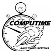
Clerk of Course - Alistair Kinsella